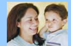
Early Childhood Workforce Development Project