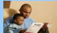
Family Literacy Programs